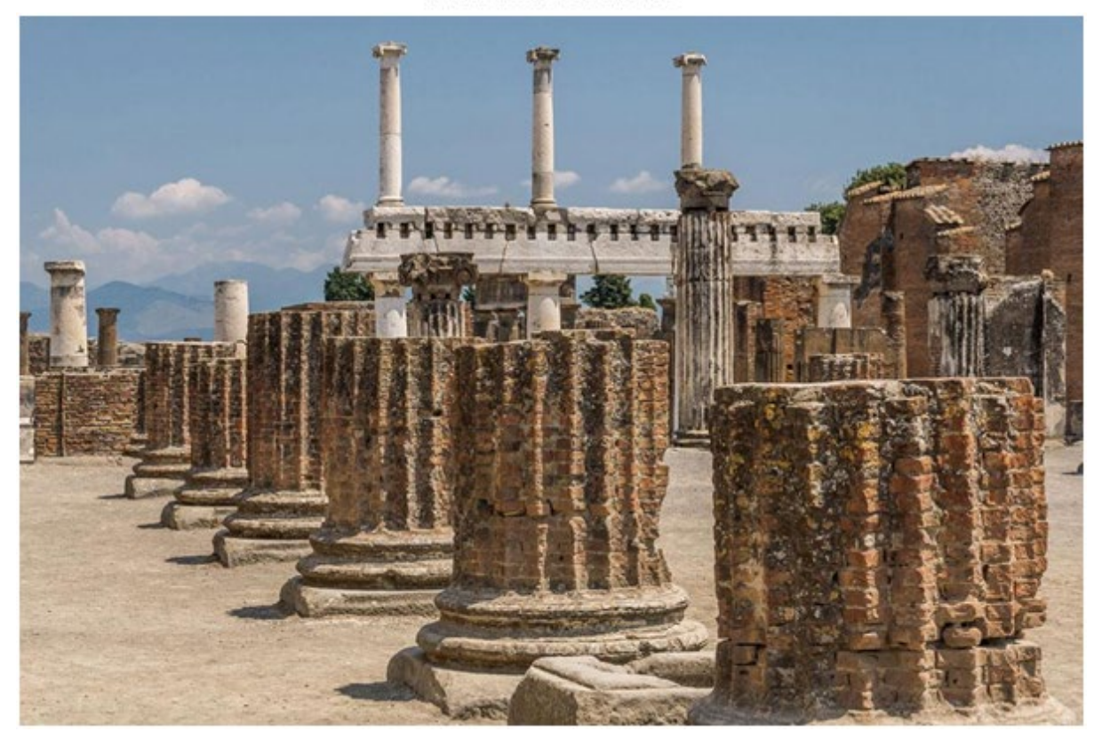
Pompeii's archeological site

After the visit, the private transfer will continue to 5* Hotel Villa Treville in Positano and check in.