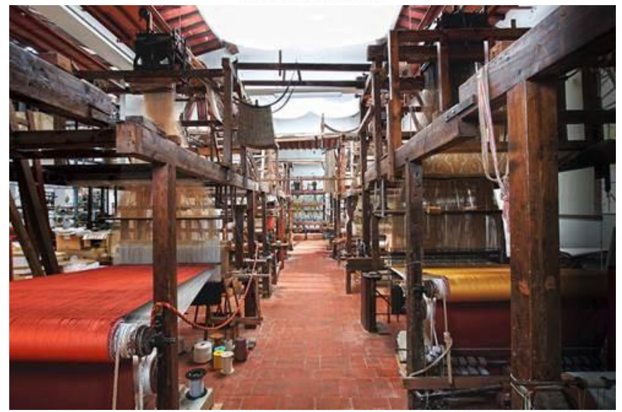
Luxury silk factory

After lunch, private transfer to another exclusive atelier, a perfume boutique just a few steps away from the Basilica of Santa Croce. Here you will enjoy a private visit of the laboratory meeting the nose of the boutique to create a tailor-made perfume.