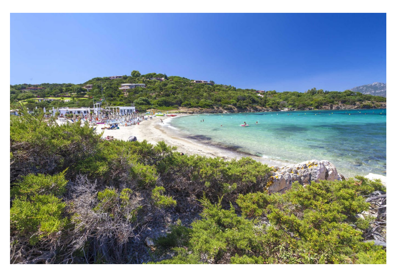
Day 16 - July 13

Enjoy the natural beauties of the beaches and their clear blue waters that have made this part of the Sardinian coast famous all over the world and a coveted destination for the international jet-set.