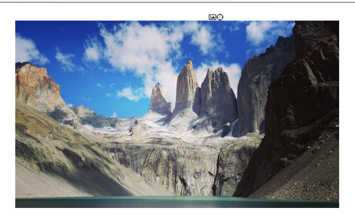
Day 8: Wednesday 10/05/23, Puerto Natales

Included: shared transport, bus ticket, room inc. buffet breakfast