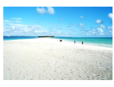
Day 4 - Nosy Iranja

Let's be seduced by this day trip to Nosy Iranja, a small island with a true taste of paradise.