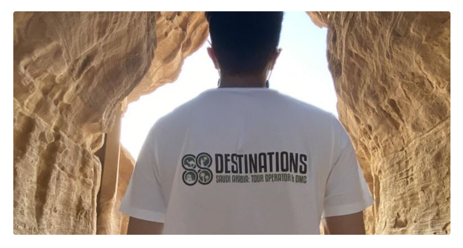
Glimpse of Saudi - Tourradar