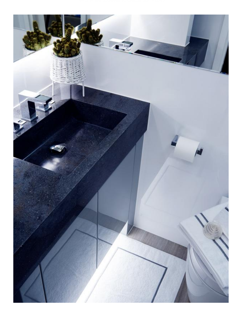
A PURE ITALIAN EXPERIENCE