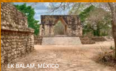
EK BALAM, MÉXICO

We will take an excursion through the central settlement, the sacred cenote, the ball game and the observatory. After we continue onwards towards Merida, capital of the state of Yucatan, known also as "The White City." In the city we will tour the Paseo de Montejo, the Monumento A la Patria, the main Plaza with its grand cathedral and the Palaces of Government. The excursion concludes once we drop off your clients at their hotels in Merida.