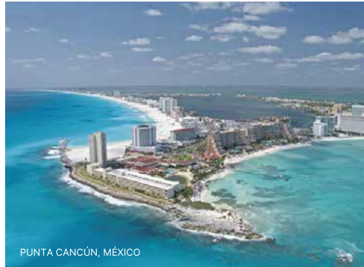
PUNTA CANCÚN, MÉXICO