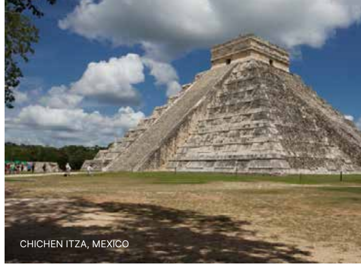
CHICHEN ITZA, MEXICO

Breakfast. Today we will visit the archeological site of Palenque, one of the most important deposits of the Mayan World, we will know the famous Pyramid of Inscriptions where the sarcophagus of King Pakal was found, with a lid recorded in relief, the temple of the Foliated Cross, the Temple of the Sun and the Palace. Return to the hotel. Lodging.