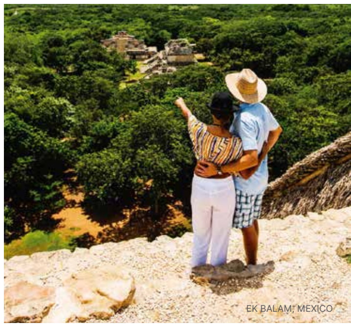
EK BALAM, MEXICO