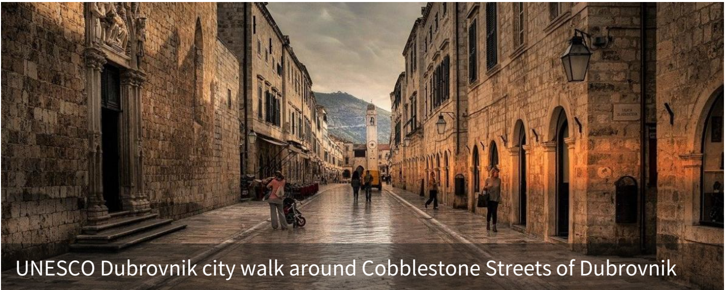
UNESCO Dubrovnik city walk around Cobblestone Streets of Dubrovnik