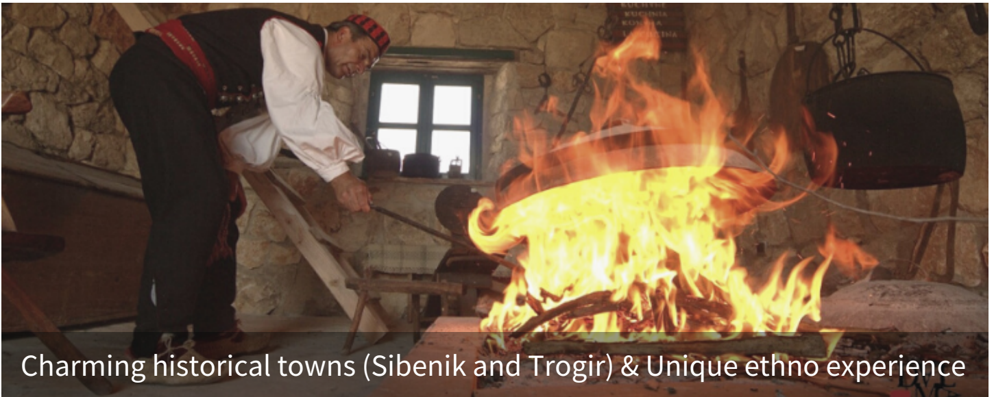
Charming historical towns (Sibenik and Trogir) & Unique ethno experience