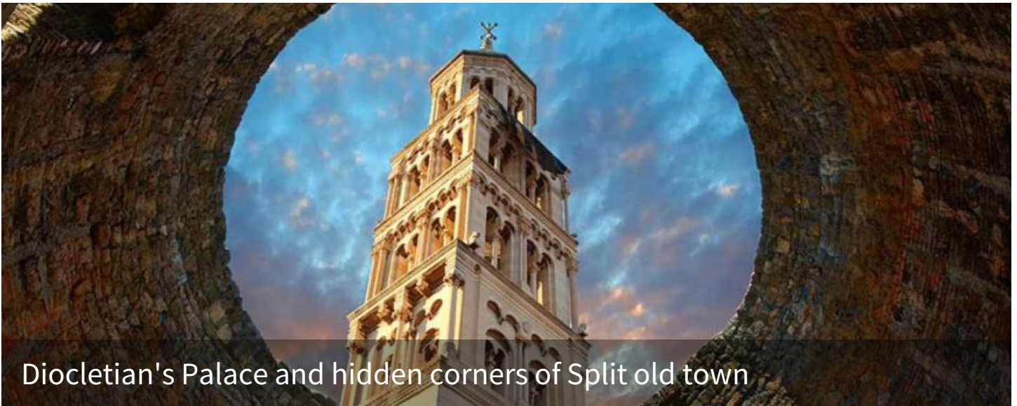
Diocletian's Palace and hidden corners of Split old town