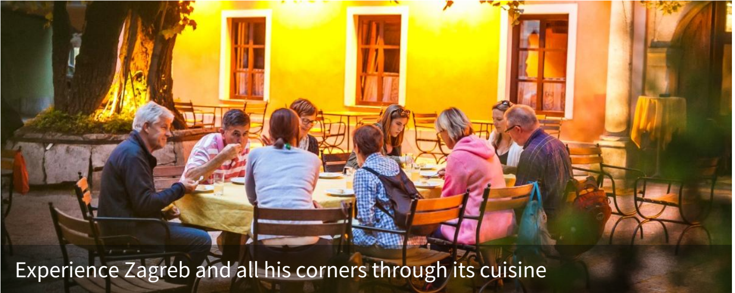
Experience Zagreb and all his corners through its cuisine