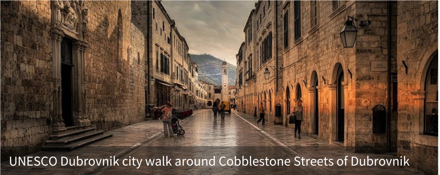
UNESCO Dubrovnik city walk around Cobblestone Streets of Dubrovnik