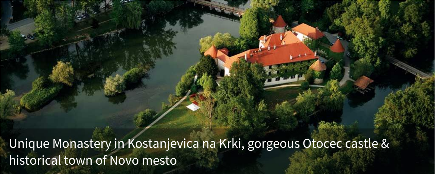
Unique Monastery in Kostanjevica na Krki, gorgeous Otocec castle & historical town of Novo mesto