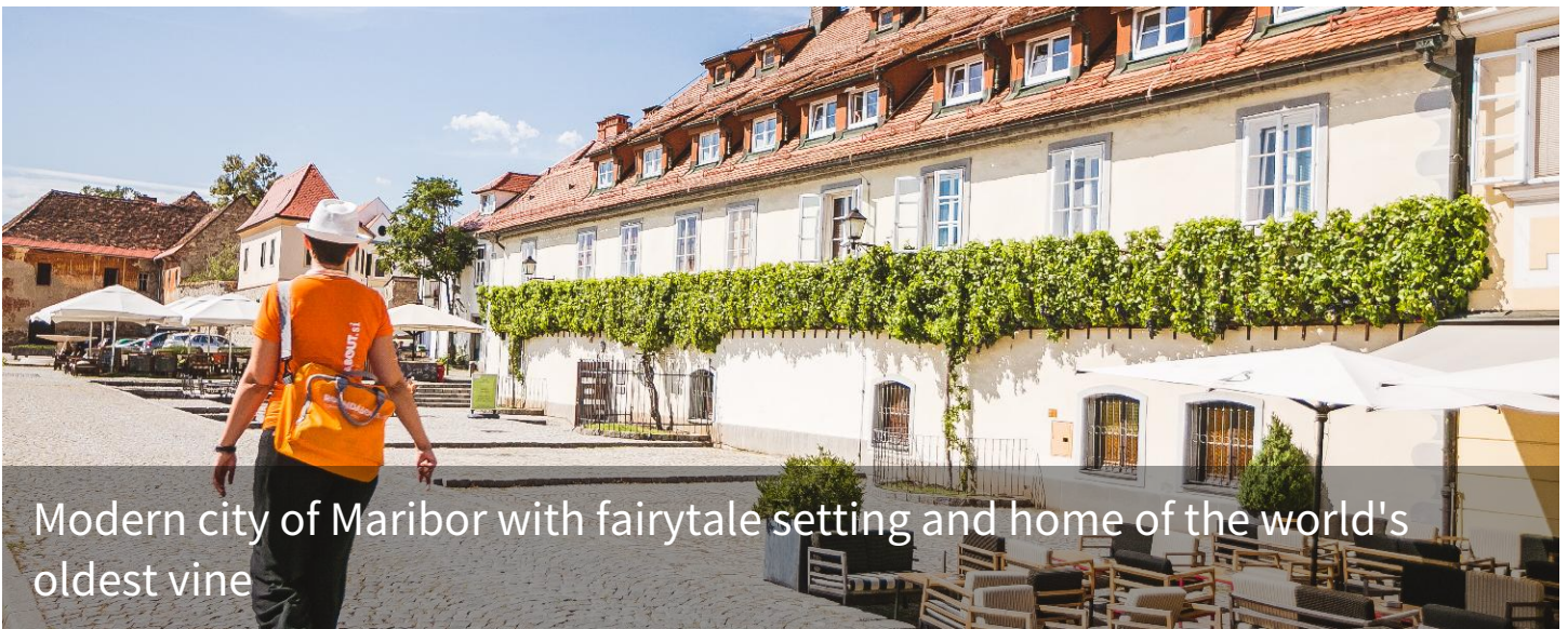
Modern city of Maribor with fairytale setting and home of the world's oldest vine