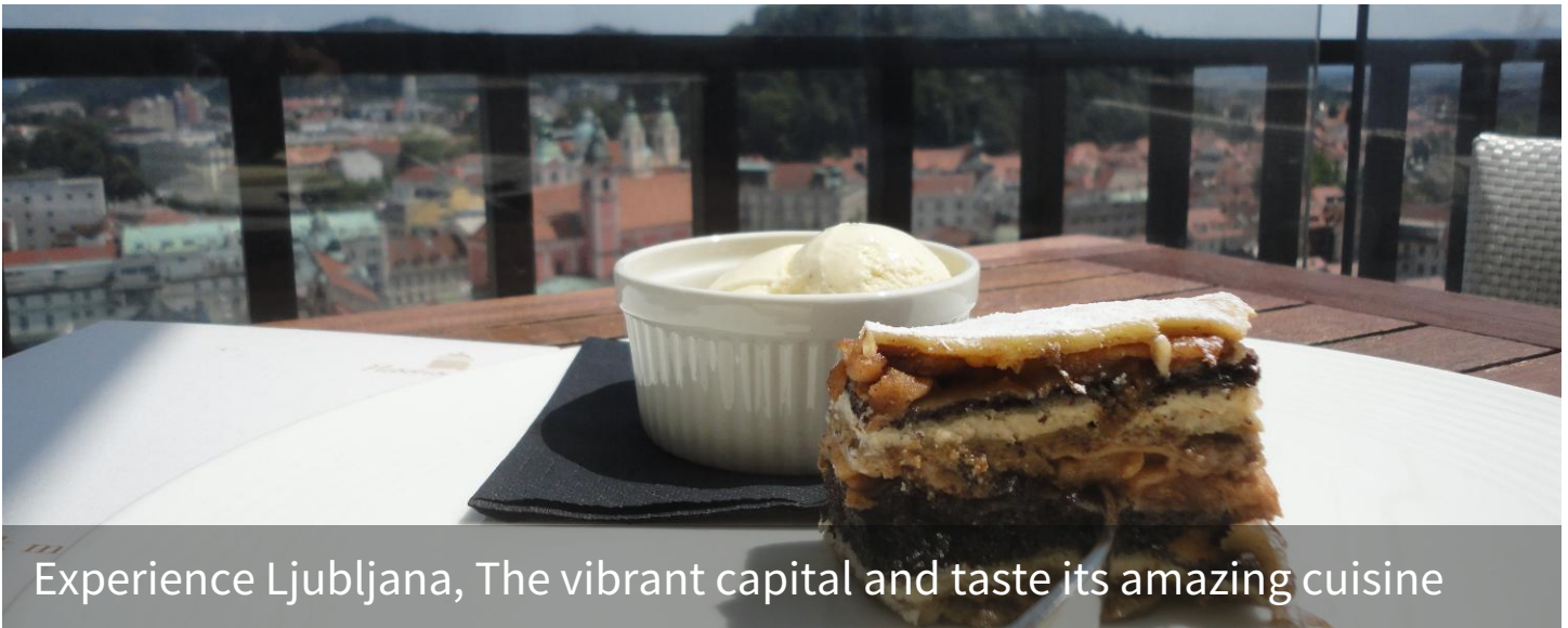
Experience Ljubljana, The vibrant capital and taste its amazing cuisine