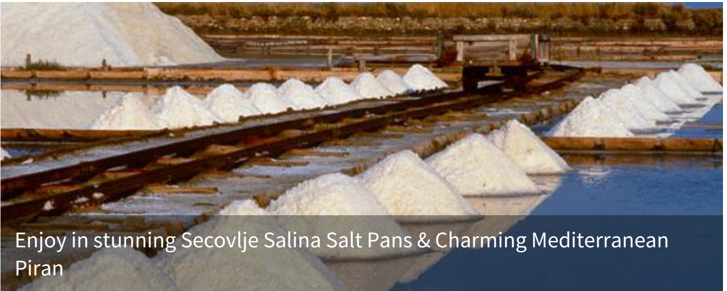
Enjoy in stunning Secovlje Salina Salt Pans & Charming Mediterranean Piran