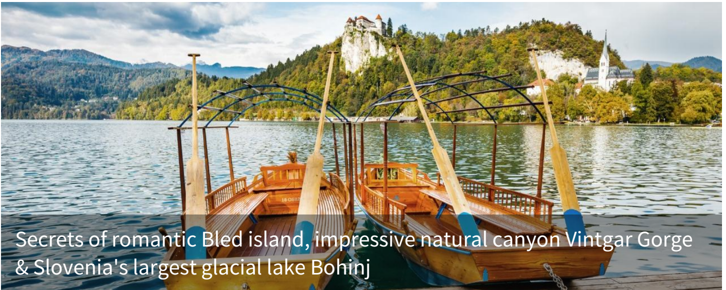
Secrets of romantic Bled island, impressive natural canyon Vintgar Gorge & Slovenia's largest glacial lake Bohinj