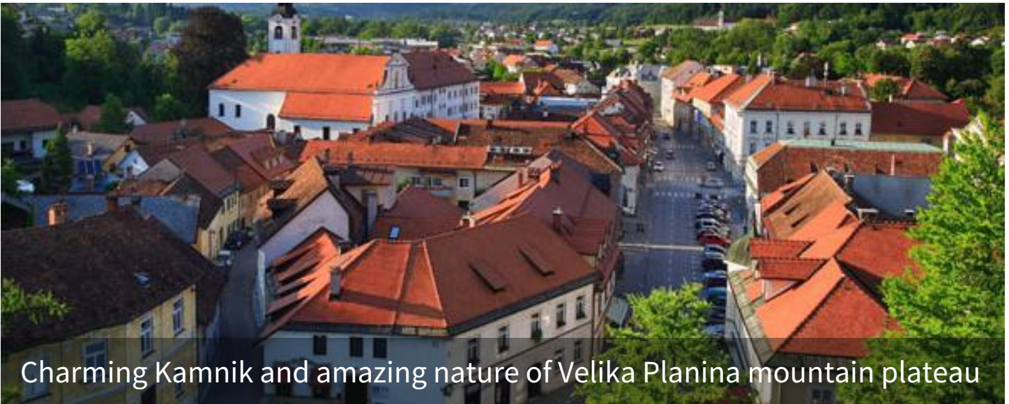
Charming Kamnik and amazing nature of Velika Planina mountain plateau