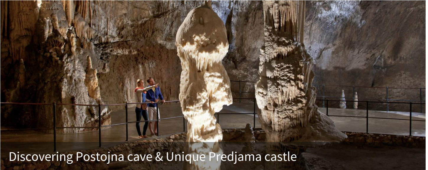
Discovering Postojna cave & Unique Predjama castle