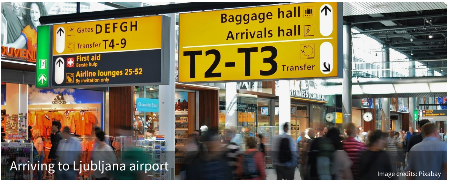
Arriving to Ljubljana airport