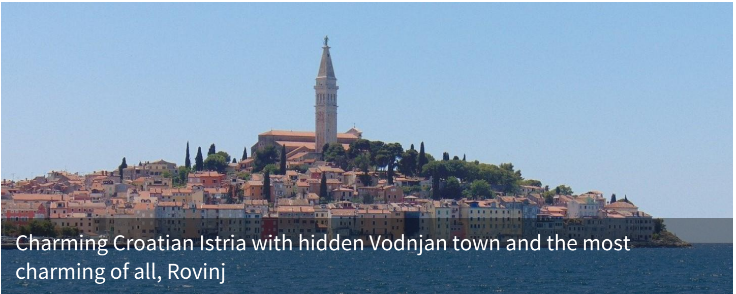
Charming Croatian Istria with hidden Vodnjan town and the most charming of all, Rovinj