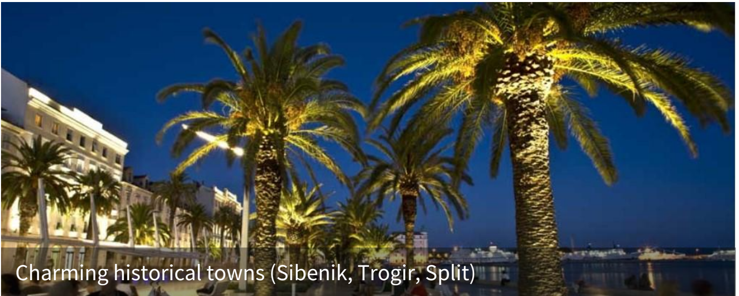
Charming historical towns (Sibenik, Trogir, Split)