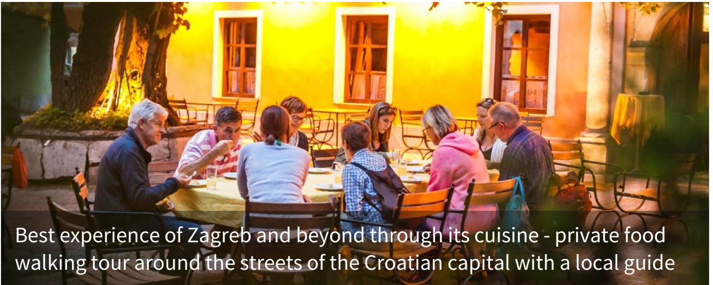
Best experience of Zagreb and beyond through its cuisine - private food walking tour around the streets of the Croatian capital with a local guide