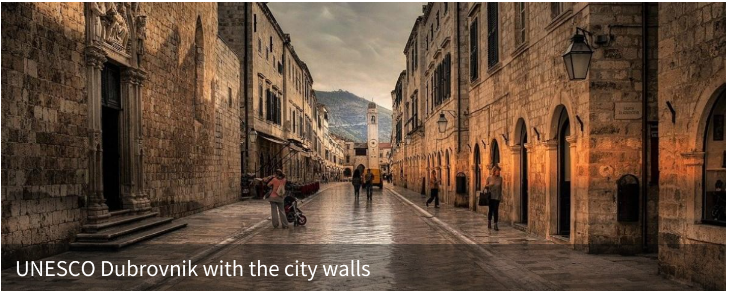
UNESCO Dubrovnik with the city walls