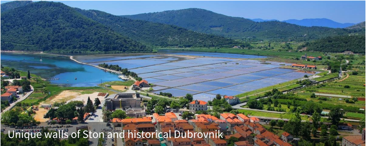
Unique walls of Ston and historical Dubrovnik