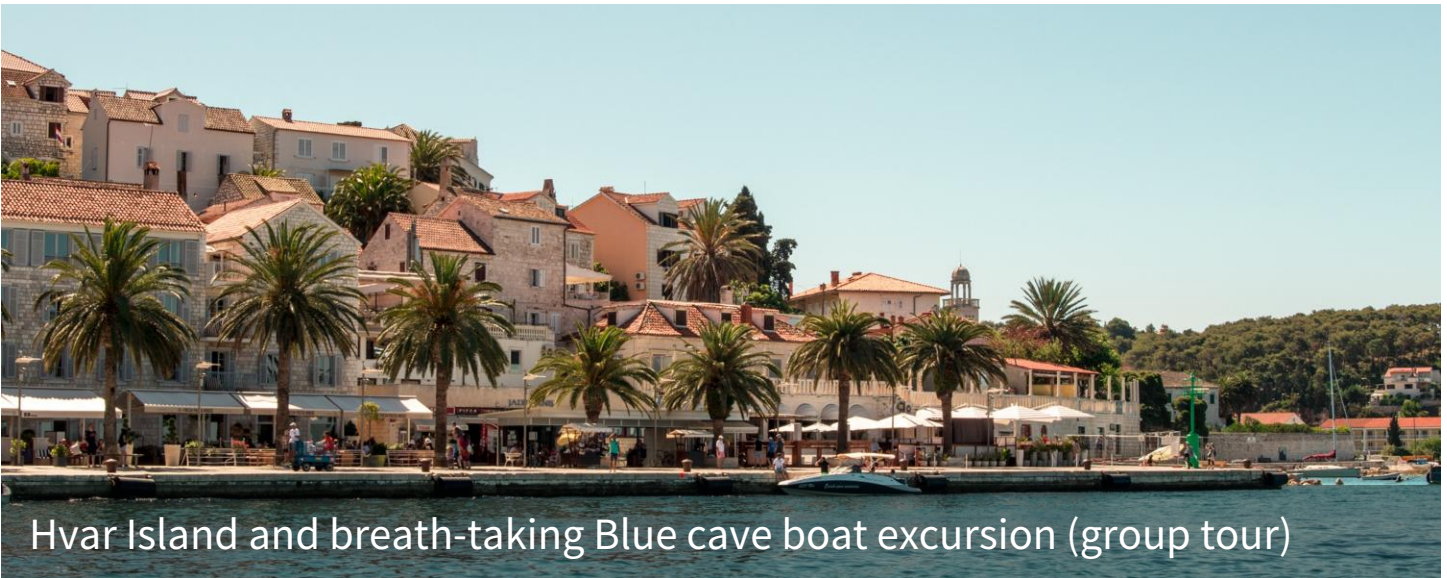
Hvar Island and breath-taking Blue cave boat excursion (group tour)