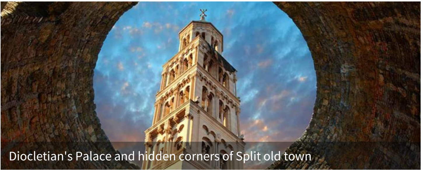
Diocletian's Palace and hidden corners of Split old town