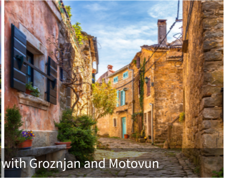
Explore charming Istrian hinterlands with Groznjan and Motovun