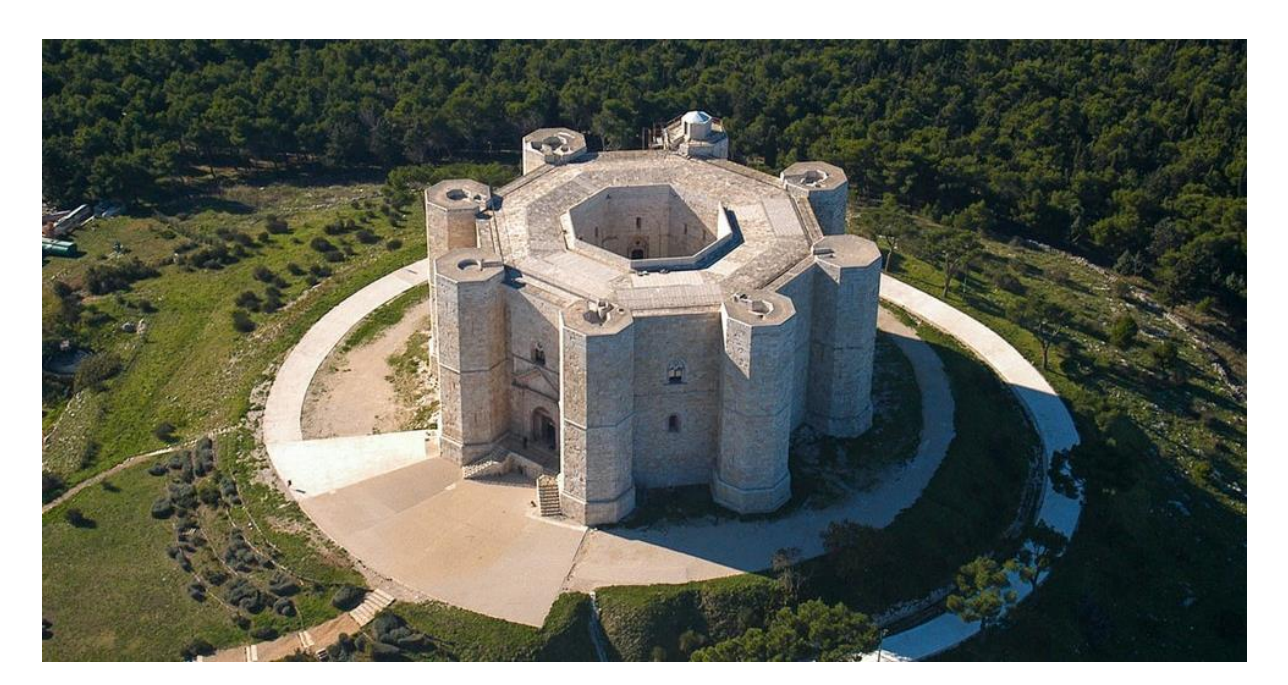
Day 3 - Duration: approx 8 hours - Breakfast and street food tastings included

At the end, private transfer back to your hotel.