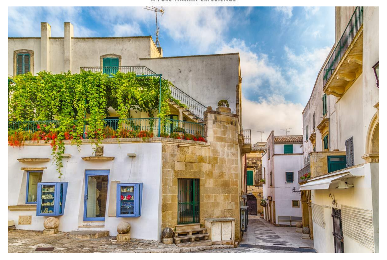
Day 5 - Duration: approx 7 hours - Breakfast and light lunch included

After breakfast, approx at 10am, meet your private driver for a full-day focused on the two charming towns of Monopoli and Polignano a Mare.