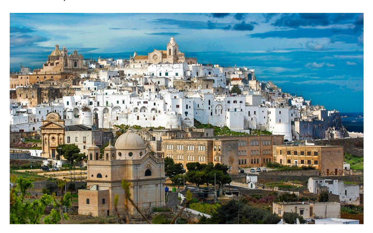
Day 4 - Duration: approx 8 hours - Breakfast and lunch included

At the of the tour, approx at 6.30pm, private transfer back to your hotel. Rest of the day and dinner at leisure.