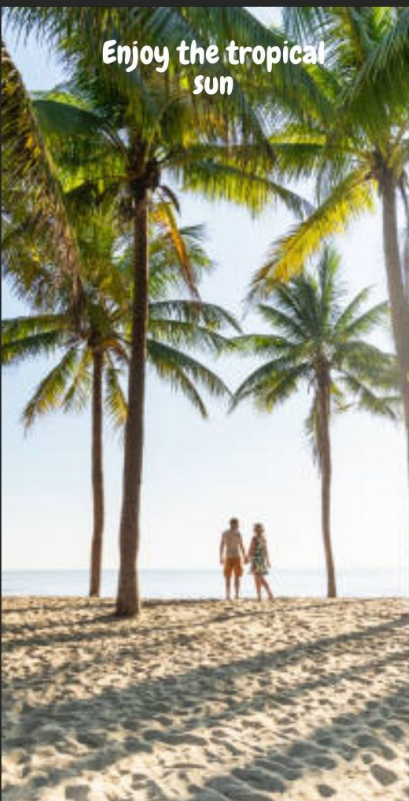
Enjoy the tropical sun