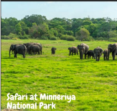
Safari at Minneriya National Park