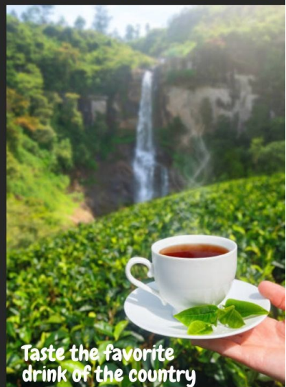
Taste the favorite drink of the country