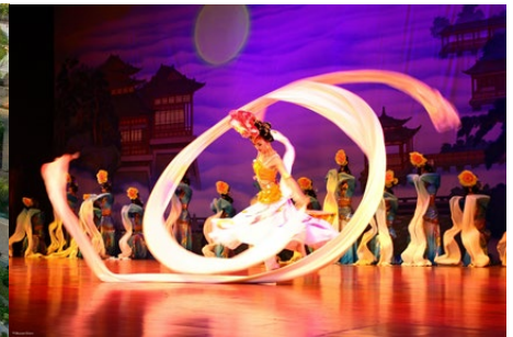
Show of the Tang Dynasty

Today, we will transfer you to the airport according to your flight HO1212 25OCT XIY - PVG 15:15 - 17:40 from Xi'an to Shanghai. Our guide in Shanghai will be holding your name sign and waiting for you at the airport. Then you will be transferred to the hotel and have a rest. The hotel check-in time is 2 pm.