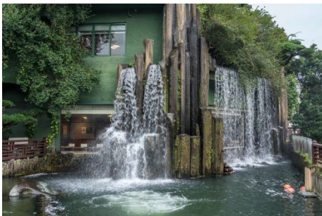
Nan Lian Garden

Next, we will visit Stanley Market , a popular outdoor market. It’s known for its wide variety of inexpensive clothing, souvenirs, and other goods. The market spans several pedestrian streets and alleyways, creating a lively, bustling atmosphere. There, you can try to bargain with the shop owners and buy some local souvenirs for your family and friends.