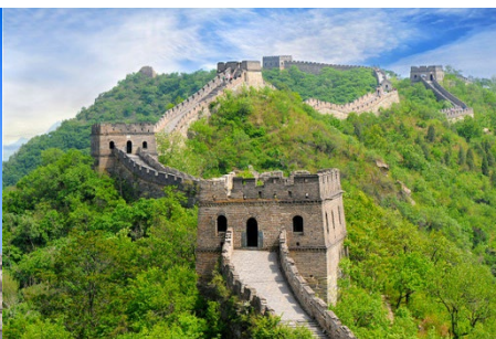
Juyongguan Great Wall