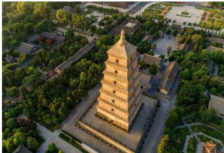
Big Wild Goose Pagoda