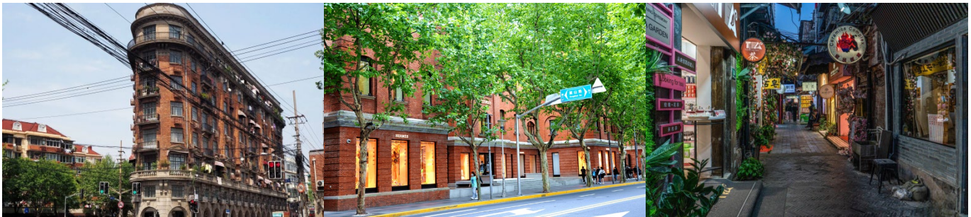
Former French Concession