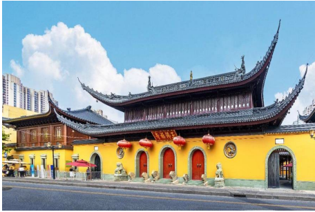
Jade Buddha Temple

Later we will take you to visit the Tianzi Fang . Tianzi Fang is a touristic arts and crafts enclave that has developed from a renovated traditional residential area in the French Concession area of Shanghai, China. It is now home to boutique shops, bars and restaurants. The district comprises a neighborhood of labyrinthine alleyways off Taikang road, a short street which is today mostly known only for Tianzi Fang. Tianzi Fang is known for small craft stores, coffee shops, trendy art studios and narrow alleys.