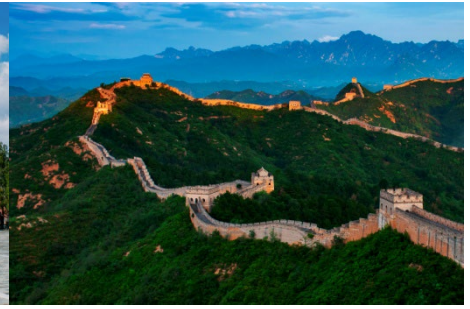
Mutianyu Great Wall

In the morning, you'll explore the Temple of Heaven , a historic site where ancient emperors once prayed to the heavens for plentiful harvests. Today, this serene park is a vibrant hub for locals practicing Tai Chi and engaging in morning exercises. Then you will be transferred to the train station and take the estimated train: G57 14:05-18:30 to Xi'an. Our local guide will then transfer you to the hotel.