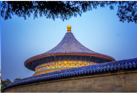
Temple of Heaven