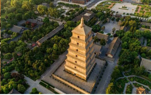
Big Wild Goose Pagoda