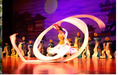
Show of the Tang Dynasty

Today, we will transfer you to the airport for the estimated flight: MU2153 10:00/12:15 to Shanghai.