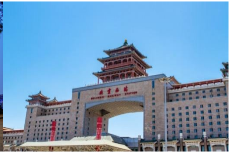
Beijing West Railway Station

This morning, we will pick you up at the hotel. Then, we will drive for about 1 hour (50 km) to visit the Terracotta Warriors and Horses Museum . It is the No.8 Wonder in the world. For over 2000 years, thousands of the Terracotta Warriors and the Horses stand silently to guard the tomb of China's first emperor--Qin Shihuang. Here, you can see not only an array of vivid clay figures but also weapons like crossbows, bronze swords, and spears.